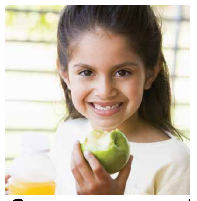
A Summer of Fun at Queens Library!